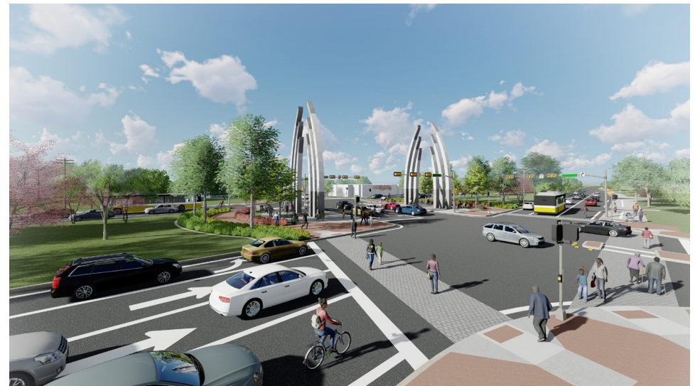
PINE STREET & S.M. WRIGHT | SOUTH EAST CORNER LOOKING WEST