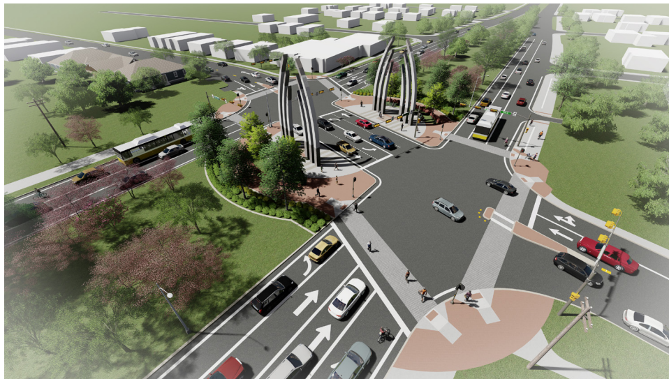
PINE STREET & S.M. WRIGHT | SOUTH EAST CORNER LOOKING WEST